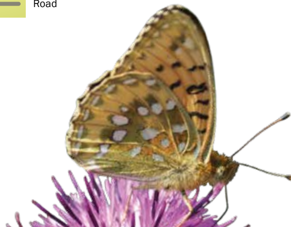
Argynnis aglaja / Dark Green Fritillary

Broad-bordered Bee Hawk-moth, Heath Fritillary, Large Wall Brown, Amanda's Blue